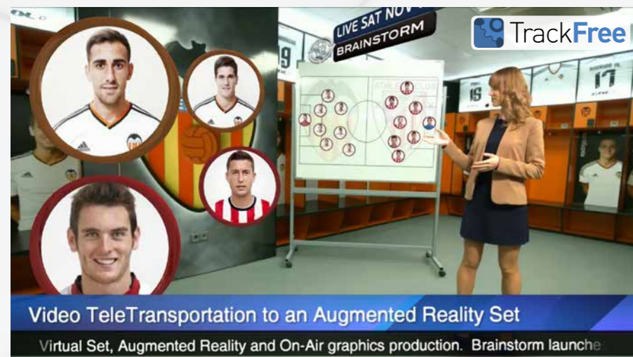
Video TeleTransportation to an Augmented Reality Set Virtual Set, Augmented Reality and On-Air graphics production. Brainstorm launches

TrackFree™ can be used in combination with the integrated internal chroma key software or external chroma key hardware, even within the same production. The whole composition is created within InfinitySet embedding the keyed feed into the virtual set, as opposed to standard chroma key layering. Combining all the above allows Infinity Set to be used in multiple operational modes. This also makes InfinitySet the ideal product for Augmented Reality applications, taking it to a new level of complexity, realism and data display never seen before.